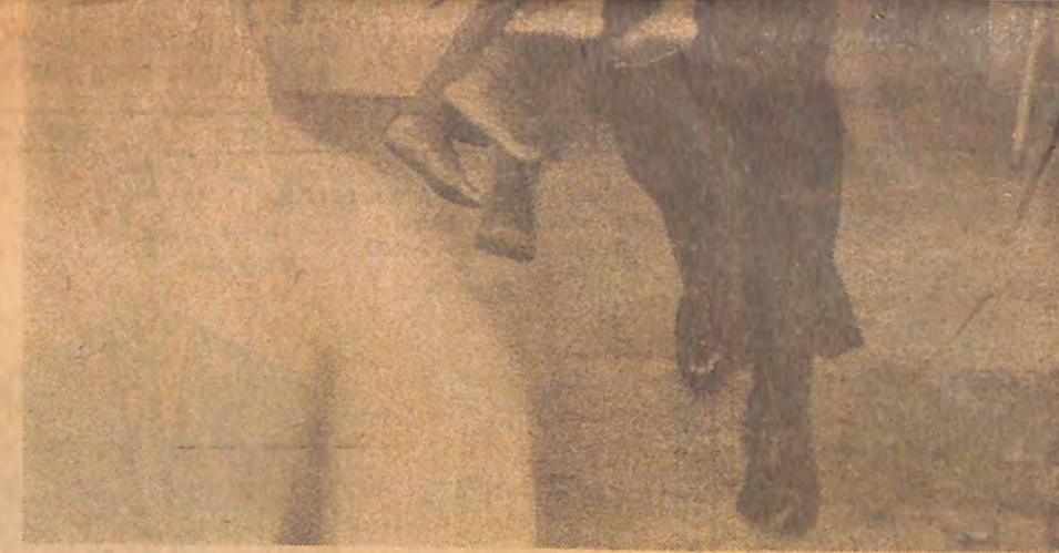
Atlanta police fired tear gas into a Negro home from which bottles were thrown —then a policeman dashed in to rescue the children inside.