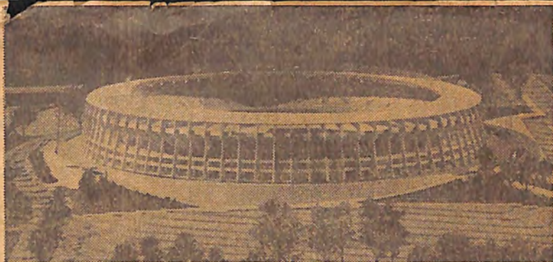
Atlanta's $18 million Major League Sports Stadium will seat 57,000 for football, 52,000 for baseball. Adjacent is largest interchange east of the Mississippi.

National Baseball League Braves' coming to Atlanta in 1966 is a natural progression for Amazing Atlanta.