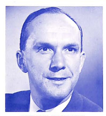
LELAND HOLLAND (Man in Space)